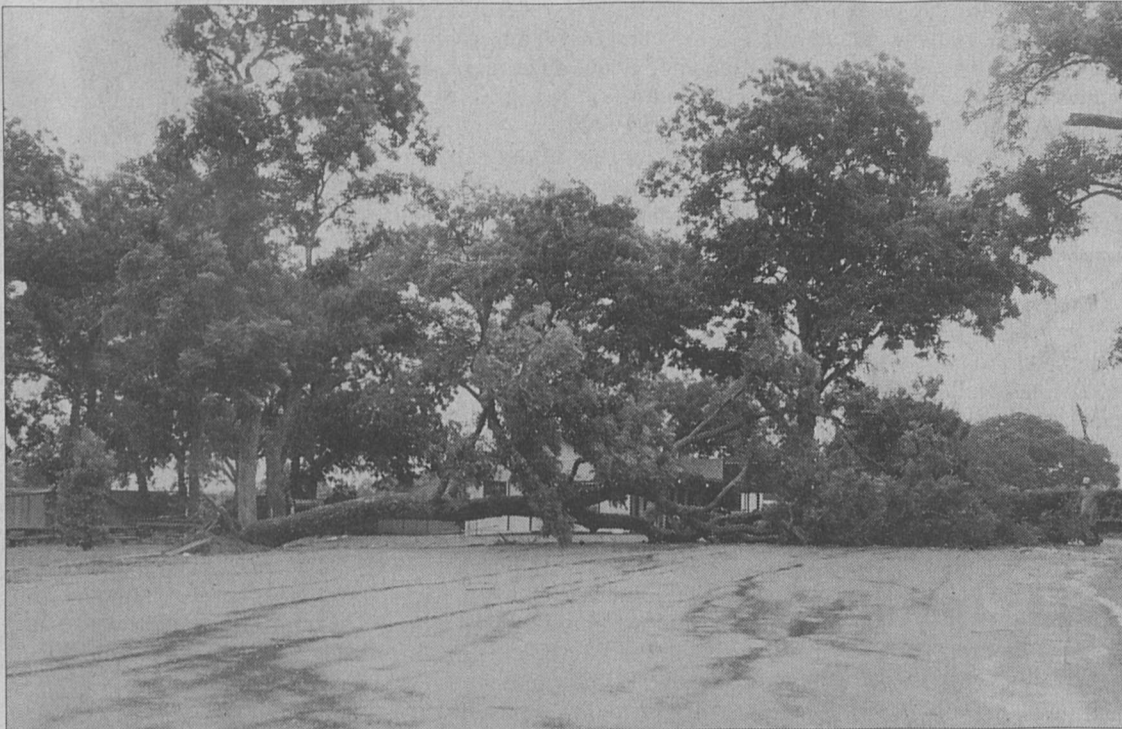
Recent heavy rains caused a large tree on the golf course to topple over. Not even two weeks into July, Eagle Lake is well over the average rainfall for the month.